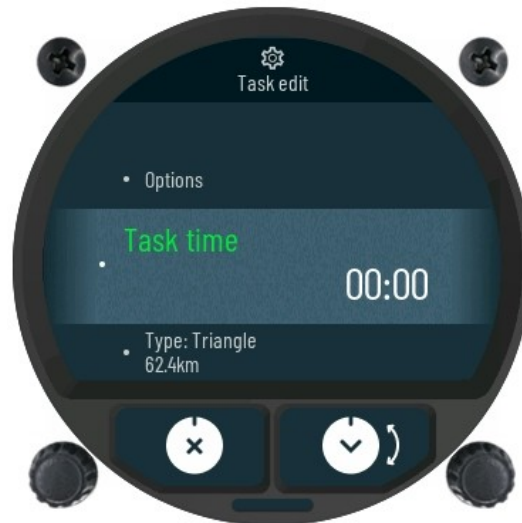
Task edit sub-page reference figure.

Under Task Options , user can select following: