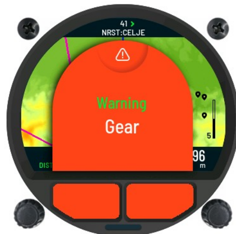
Gear warning view.