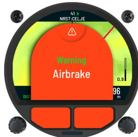
Airbrake warning view.

Airbrake warning will be displayed, when glider airbrakes are engaged.