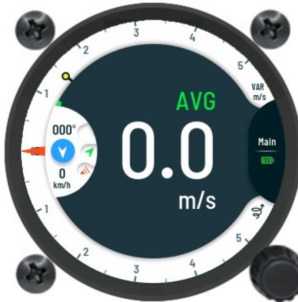
Displaying one information's on the main screen.

Large view area of the main screen is used to display digital numeric information. The pilot can set up to four digital numeric values at the same time on the main screen. Type of them can be set by user for each flying mode (thermal / glide).