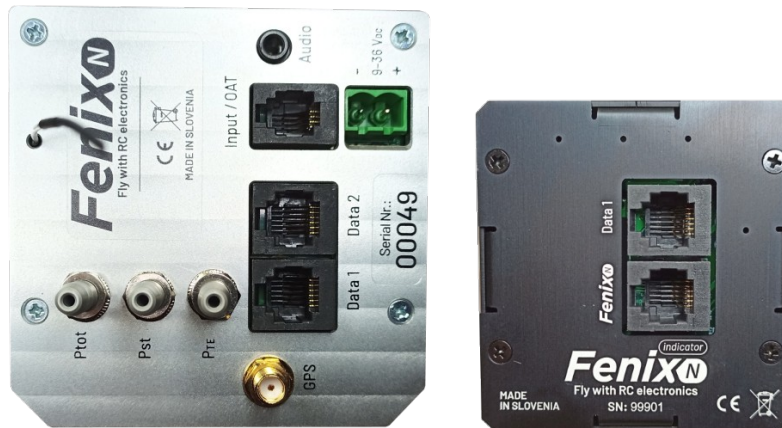
Rear of the system.