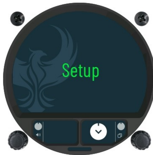
Setup page view.

System settings do not relate to pilot profile but to settings of the glider, device internals periphery, external connected segments to the device, etc. System settings are common for all pilot-based settings.