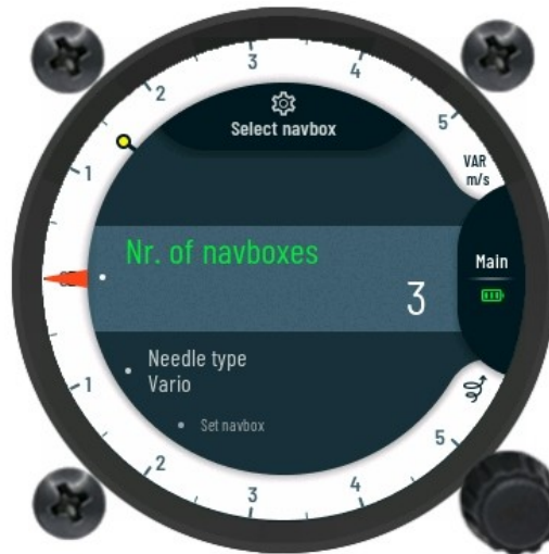
Page Select navbox.

The sub-menu Select navbox is where pilot can set number of navboxes on indicator main screen for each flight mode, type of needle for each flight mode and type of navbox displayed. To enter Select navbox sub-menu, pilot must use long press function while on main page.