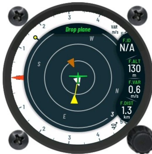
Flarm radar page reference figure.

With the externally connected Flarm device into a data 2 port of the main unit, nearby objects can be viewed on the Flarm radar page . Displayed graphical radar on the main screen and additional numeric information on the side, will give the pilot quickly needed information about the surrounding gliders.