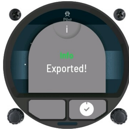
Successfully exported user profile.

Successfully exported profile will display Info with the message Exported!