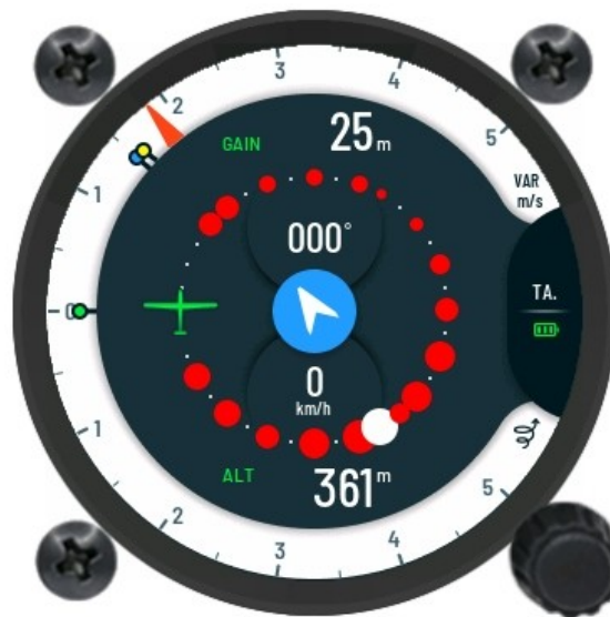
Thermal assistant page.

Current vario, average and thermal average vario are always shown as colored dots on vario scale!