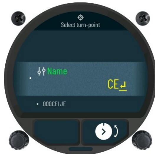
Using Name filter for selecting the turn-point.

To change type of displayed navbox, make a long press on right rotary-knob and customization mode for navbox positions will be activated. Once entered, current selected navbox position will be displayed with yellow color.