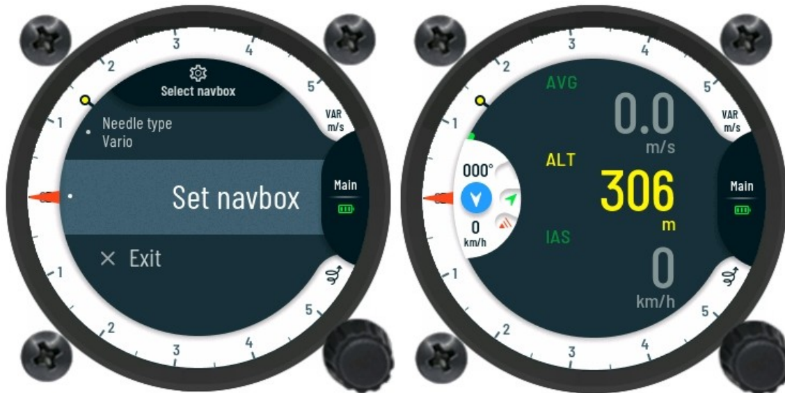
Option for change navigational informational.

Information displayed on main screen are specified by Set navbox sub-page. By confirming selection, display will show main page for customization of displayed navigational data.