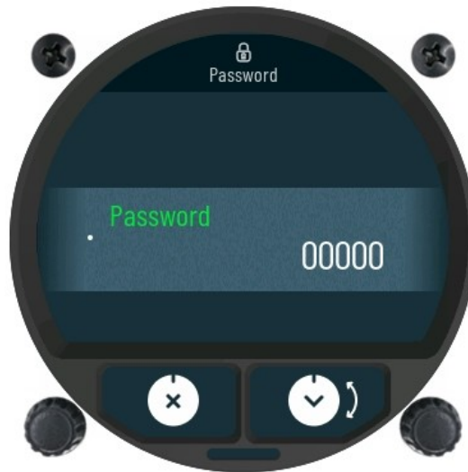
Password page reference.