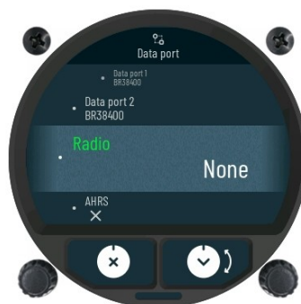
Data port sub-page reference.