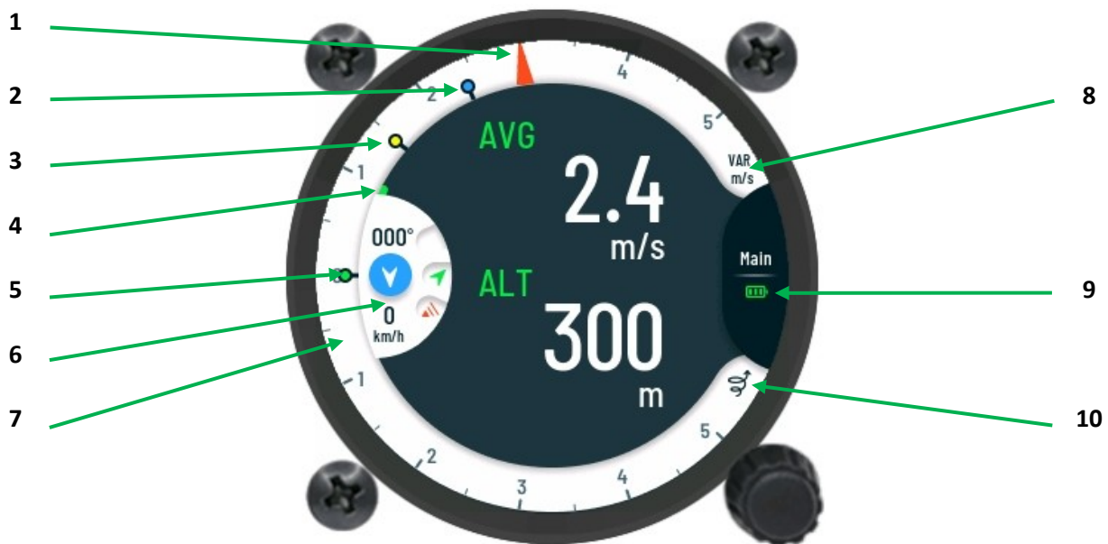
Reference view of main page.

Additional status displays show BT connectivity, battery level, GPS reception, Flarm connectivity and device current flight mode.