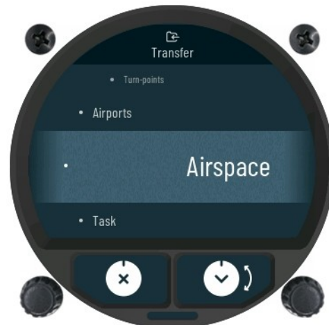
Airspace file copy.

Select sub-menu for desired file transfer. In this case we selected Airspace .