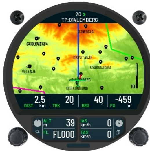
Turn-point navigation page reference.

Navigation towards turn-point can be set and viewed on Turn-point navigation page. Once *.cup files are saved in to internal memory and selected, turn-points will be displayed on the map as drops like icons.