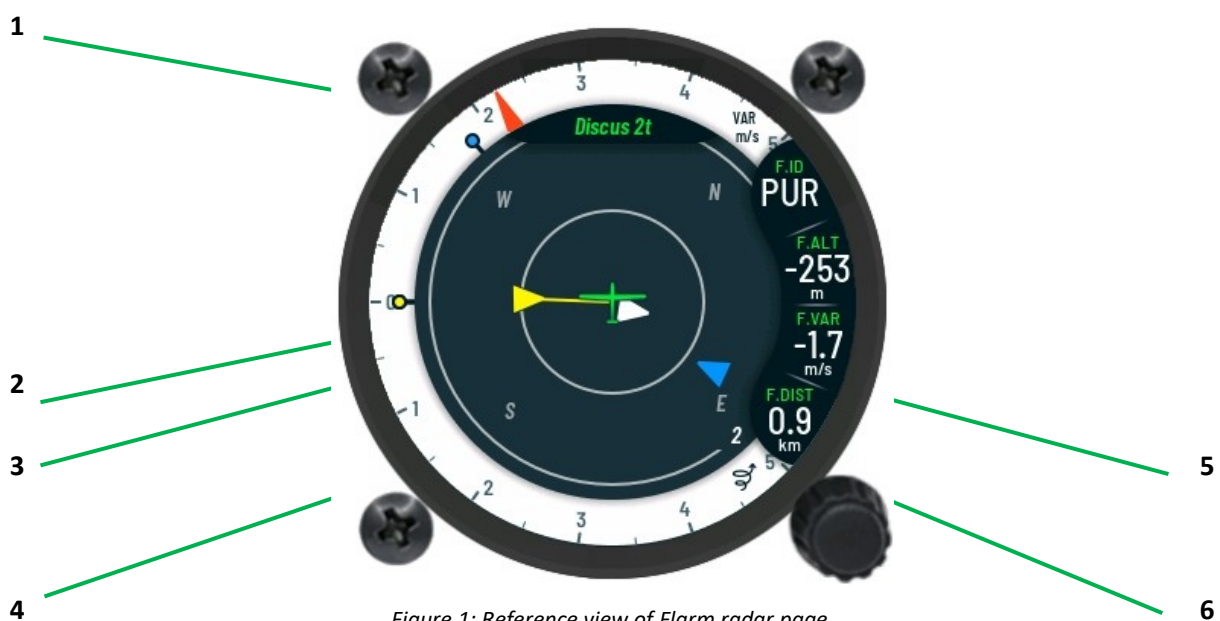
Figure 1: Reference view of Flarm radar page.