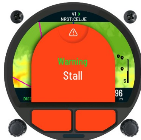
Stall warning view.