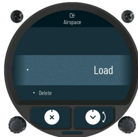
Load external SD files.

To copy new file to the device, select Load .