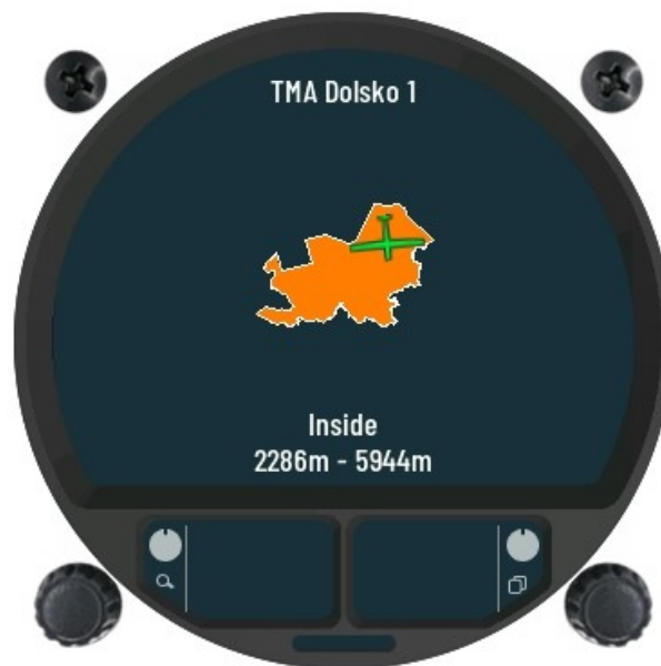
Airspace page view.

With rotation of left knob, pilot can view all nearest airspaces.