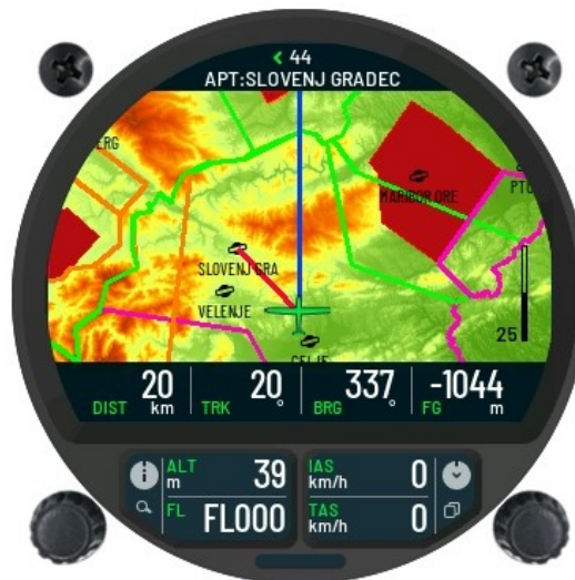
Airport navigation page reference figure.

Navigation towards single airport can be set and viewed on Airport navigation page. Once *.rca files are saved in to internal memory, selecting the file will display airports on the map.