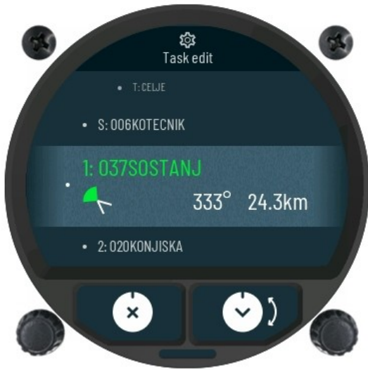
Task edit sub-page with navigation points.