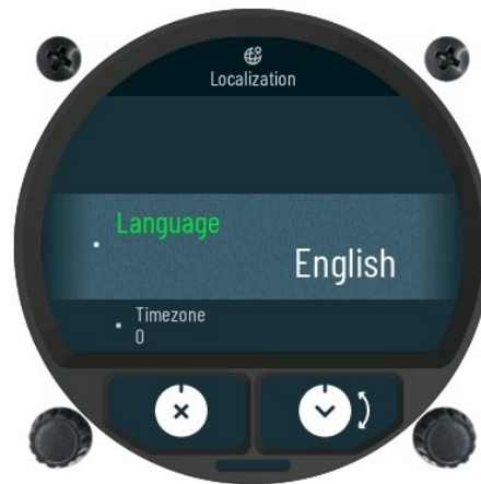
Localization sub-page reference.