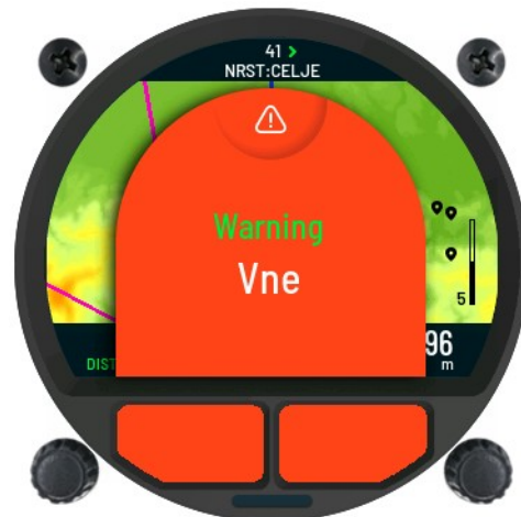
Vne warning view.