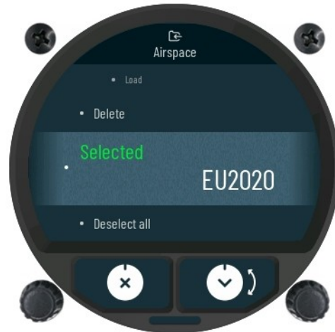
New copied file in sub-menu Selected.

After successful copy, new file can be selected in sub-menu Selected .