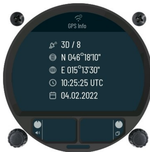
GPS Info page.