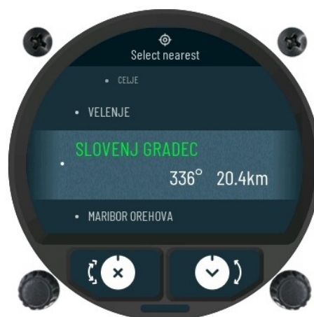
Displayed list of 20 nearest airports.

To view the list of land-able points that are in close proximity, the pilot must press right rotary knob. Once performed, the list will be displayed. The pilot can then select any point on the list.