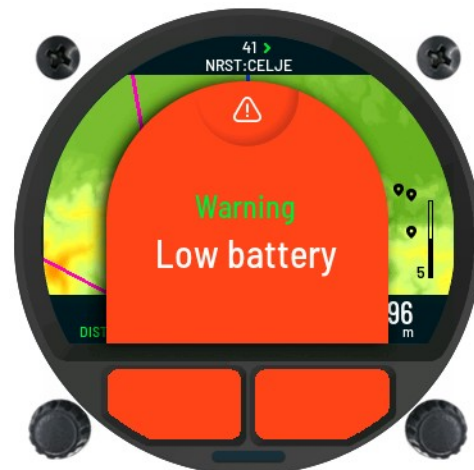
Low battery warning view.

Low battery warning will indicate a low external voltage.