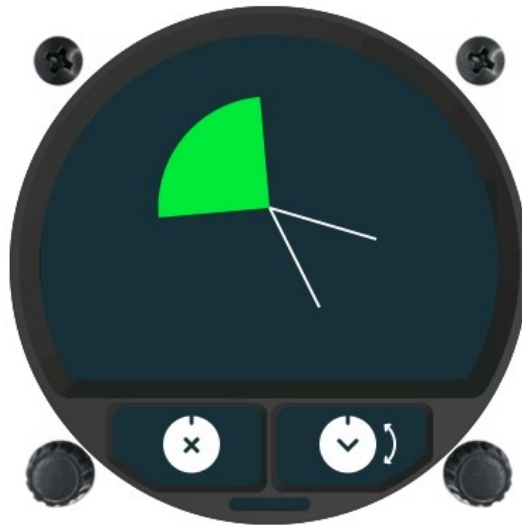
View of turn-point zone.