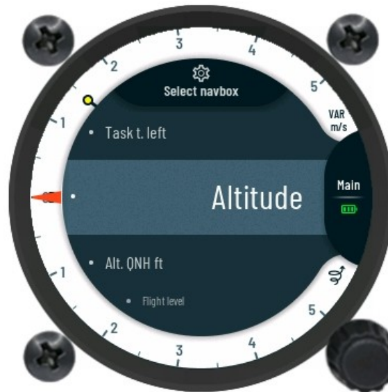
Select navbox page.

On Select navbox subpage, pilot can scroll through the navigation list of data.