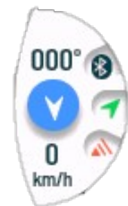
Wind and connectivity status view.

Flarm and Bluetooth connections are fully operating if icons are displayed. For GPS reception, green color will indicate 3D mode, while red will indicate no GPS fix.