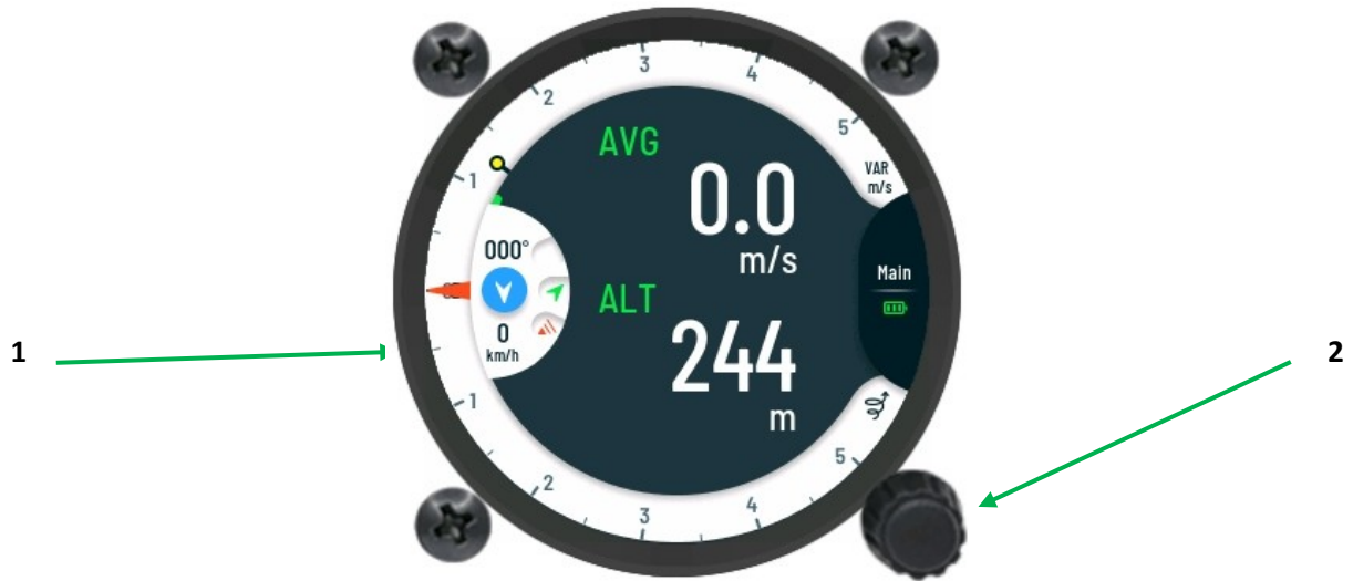
Reference front view of indicator.