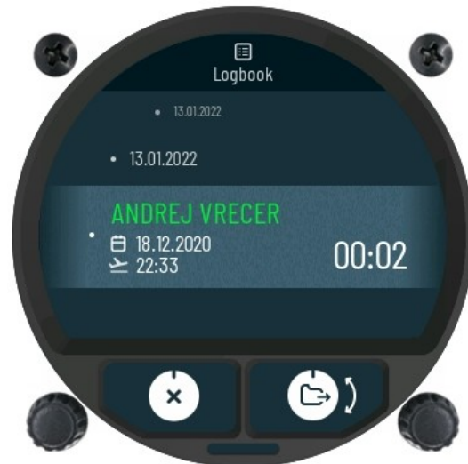
Logbook list of saved flights.

With the displayed list of all saved flights, the pilot can scroll through the list by rotating the bottom rotary knob. On a list, pilot name, date of takeoff, time of takeoff and flight time can be seen.