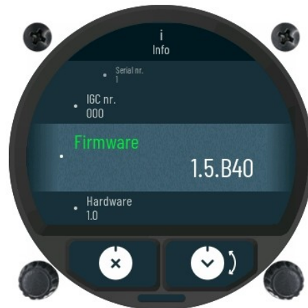
Info sub-menu reference.

Enabling Club Mode will offer user to set a custom password. With setting a password, all current settings are used then as admin settings.