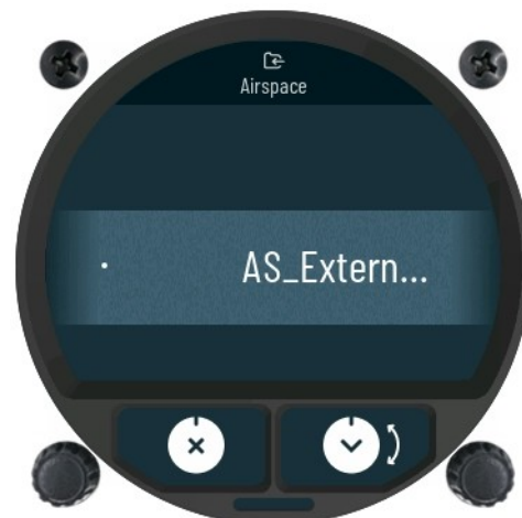
Selecting Airspace file.

External SD card Airspace files will be displayed. Once file is selected, process of copying file will be performed.