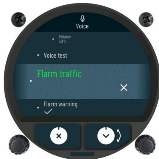
Voice page reference.