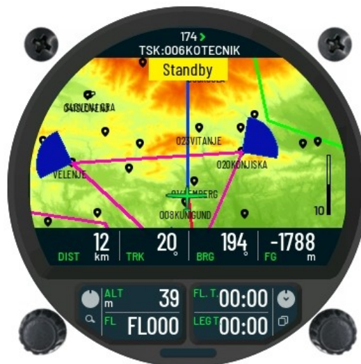
Task navigation page reference figure.

Generated task from airports, turn-points or combination of both can be displayed on Task Navigation page. Tasks can be uploaded from external SD card to internal memory of the main unit. For transferring files in to the unit internal memory use Task Options .