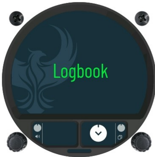
Logbook page on main screen.

In the ground stationary mode, the Logbook page will only show its name on the screen. During this mode, the pilot can access saved flights with a press of bottom rotary knob.