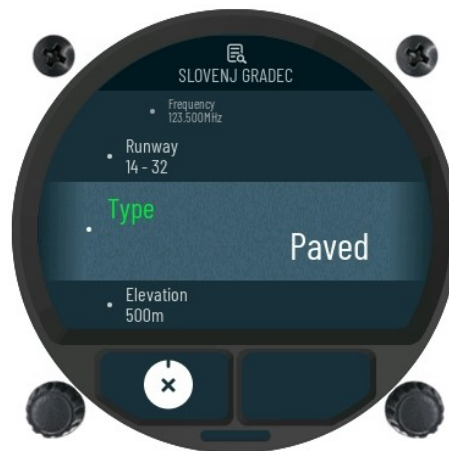
Properties of the selected airport.