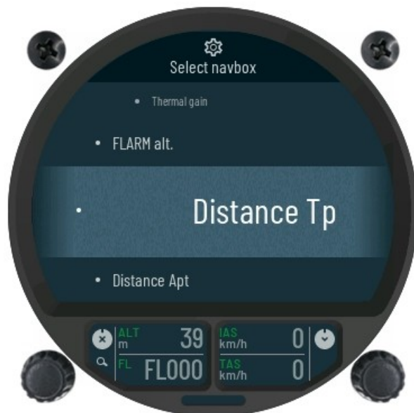
Navbox data list reference figure.

To finish customization, use left knob to exit set navbox mode.