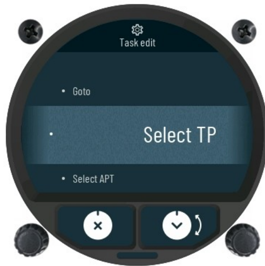
Edit menu sub-page for navigation point.