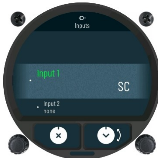
Inputs sub-menu reference.