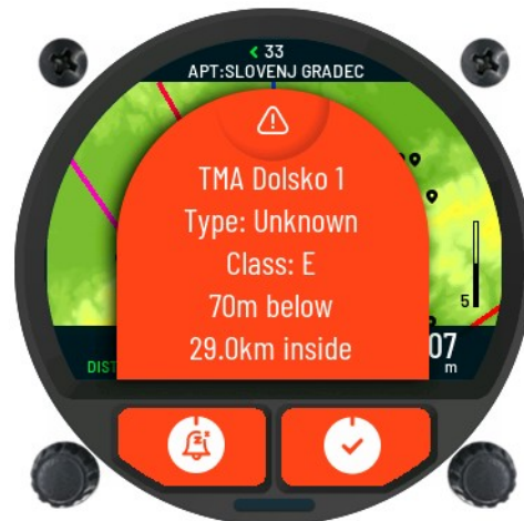
Airspace warning view.

NOTE Airspace confirmation is only valid until the landing. After new takeoff, airspace warning will be displayed again.