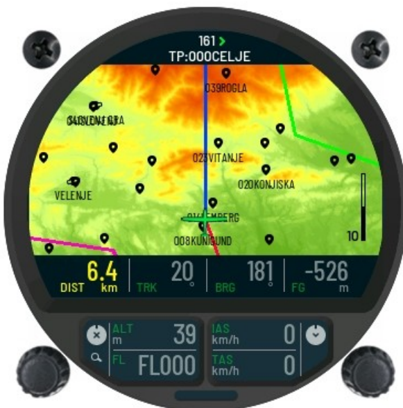
Customization mode for navbox indicators at TP page reference figure.

Pilot can scroll this indicator through displayed navbox positions by rotating right rotary knob. With selected position, another short press of bottom rotary knob displays a list of all available navigation data.