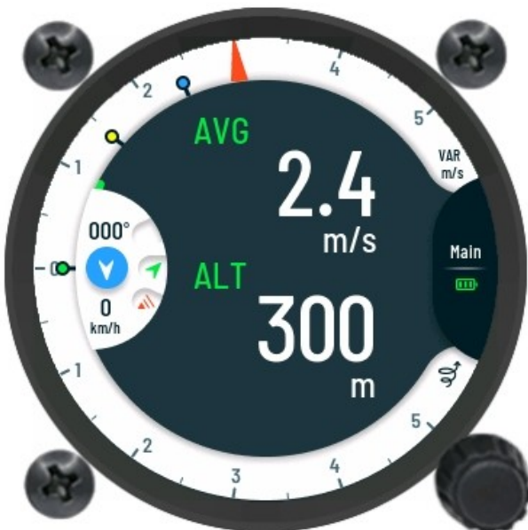
Displaying two information's on the main screen.