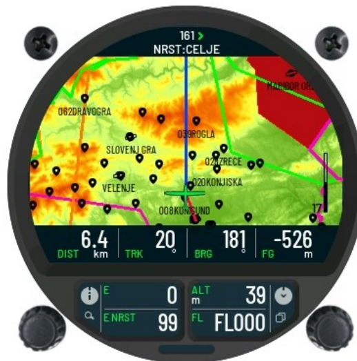
Nearest airport sub-page reference figure.

The NRST or Nearest land-able point page can display the 20 nearest airports / land-able points that are in close proximity. The pilot can select any of the displayed land-able points on the screen to view their properties.