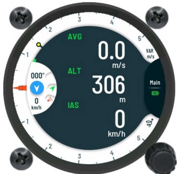
Displaying three information's on the main screen.