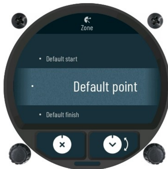
Zone sub-page reference figure.

Short press with bottom rotary knob will display subpage Zone , where setting for default parameters of point zone: start, turn point and finish sector can be set.